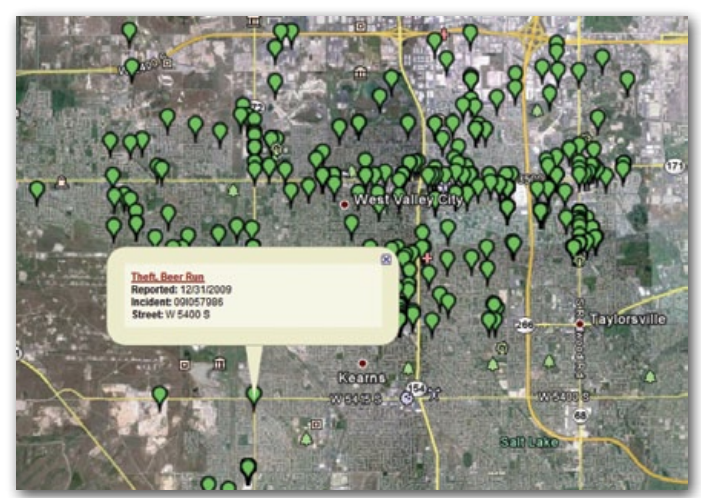
View crime hotspots using Google Maps<sup>™</sup>. By hovering over an incident, you can see the incident type, date, and the proximate address.